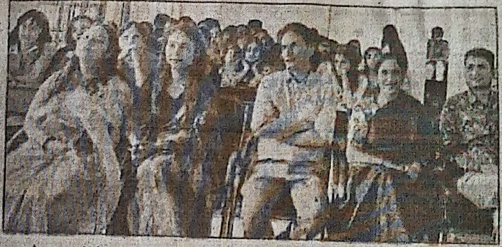
सोलन कॉलेज में समारोह के दौरान विद्यार्थी और अन्य।

सोलन कॉलेज में बीवॉक विभाग ने मनाया अध्यापक दिवस